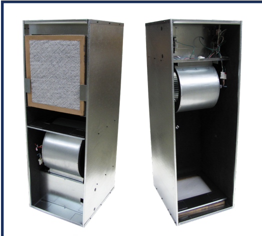
Unit shown with service panels removed. Representative image only. Some models may vary in appearance.